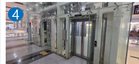
가로 0.9m 세로 2.09m

ENVEX ENVIRONMENTAL EXHIBITION ▶ 부스높이 제한 - LINE 1~2 : 4m - LINE 3~4 : 4.5m - LINE 5이상 : 5m ● 기둥 1,200mm x 1,200mm ■ 소화전