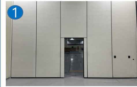
가로 0.9m 세로 2.1m